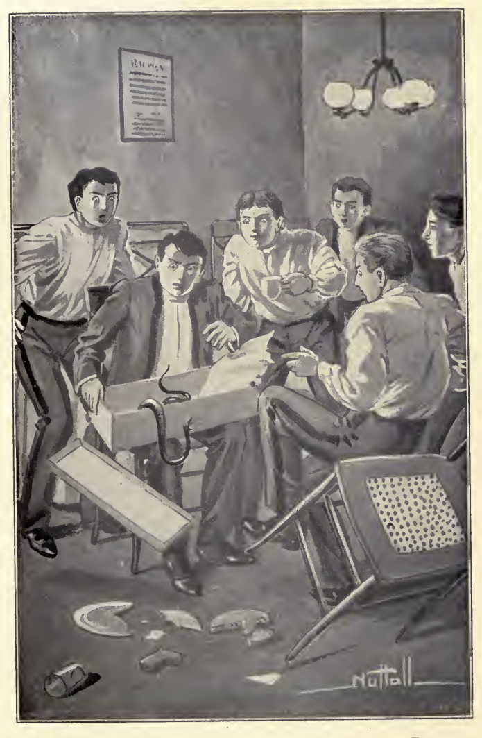
FROM OUT OF THE BOX GLIDED A REAL, LIVE SNAKE.—Page 123. The Rover Boys on the Farm.